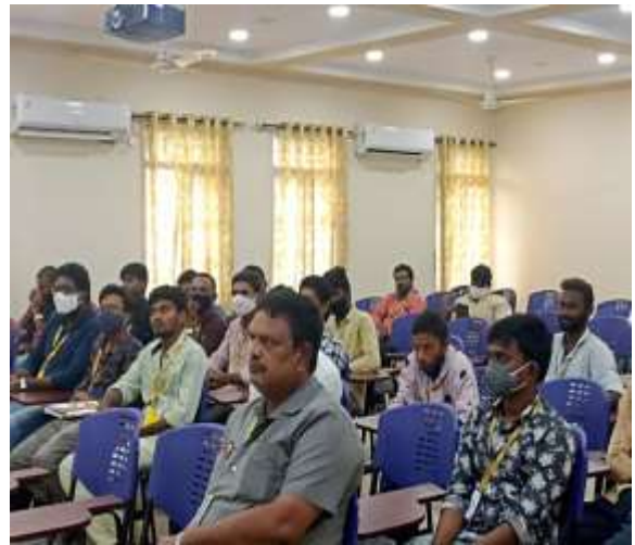
Students during event